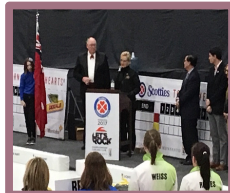
Opening Ceremonies for the Scotties Provincial Curling Championship