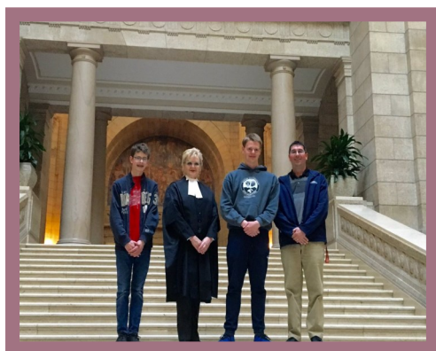
Oak Park Students who visited Vimy Ridge