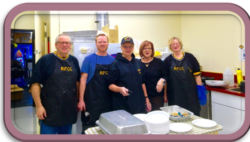
Roblin Park Winter Carnival