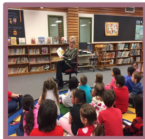
I Love to Read at Beaverlodge School