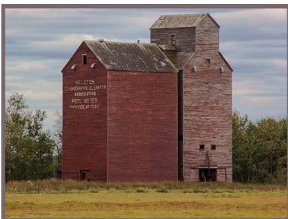
Pool elevator at Helston