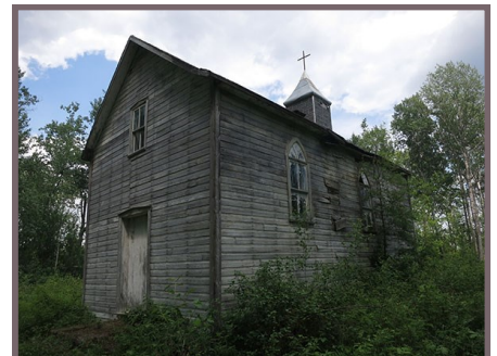
Our Lady of the Snow Catholic Church